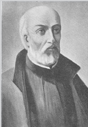
St. John de Brebeuf